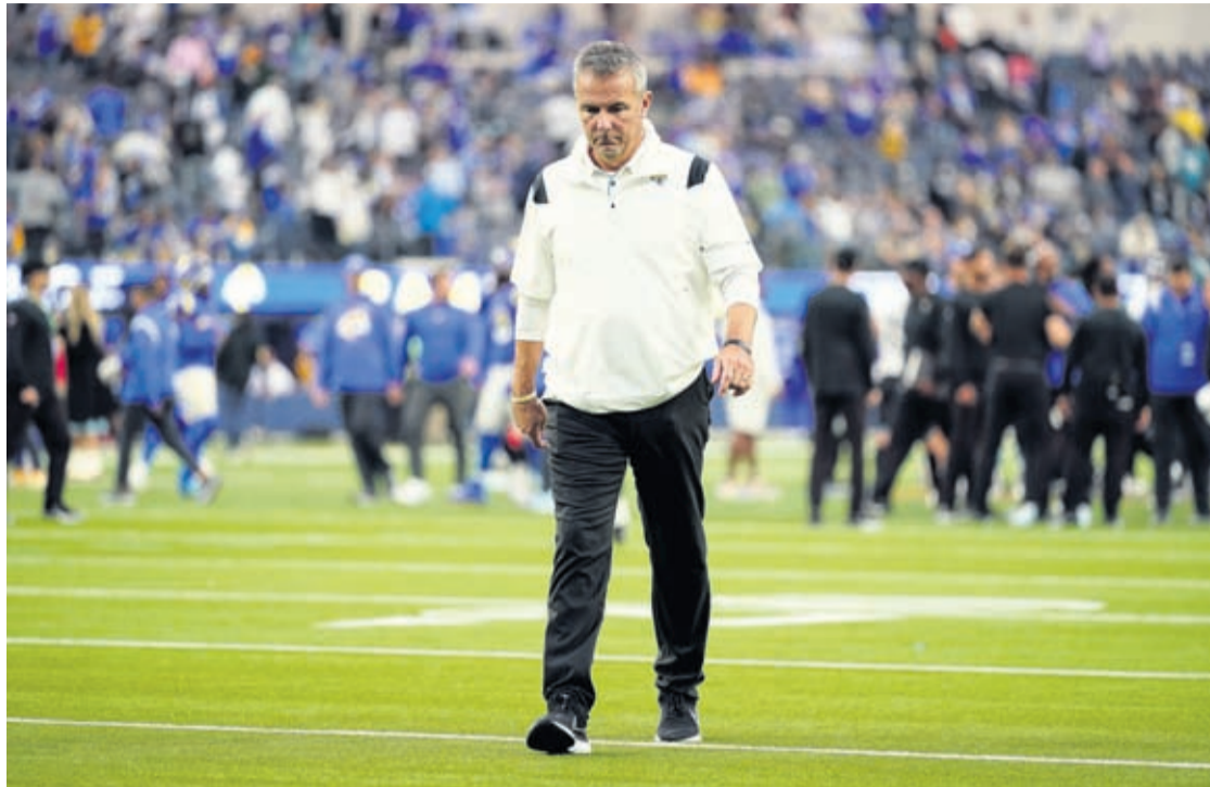
Jacksonville Jaguars head coach Urban Meyer walks off the field after a loss to the Los Angeles Rams during an NFL football game Sunday, Dec. 5, 2021, in Inglewood, Calif.

In that sense, Meyer's firing hardly qualifies as a surprise. And it hardly matters whether the final straw was the report in a Florida newspaper about Meyer kicking a former kicker in disgust back in training camp last August. Jaguars owner Shad Khan had so many gaffes to choose from that the statement he released Thursday — "an immediate change is imperative for everyone" — could have been written shortly after his coach got caught grinding in a bar in late September. Or anytime last month, when Meyer's offense was